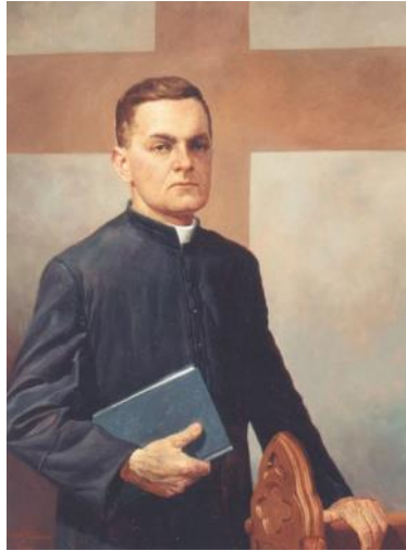
Father McGivney Pray for US

The deadline for material for publication in the Mariner is the Friday that follows the 3rd Wednesday of the prior month. PLEASE keep this deadline in mind for articles you wish to have publish in the Mariner.