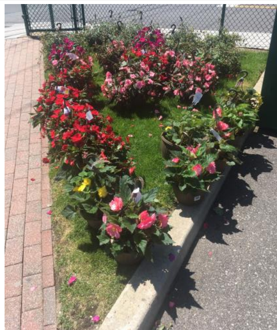
Plant Sale on May 6 & 7 at St Kilian Church Parking Lot