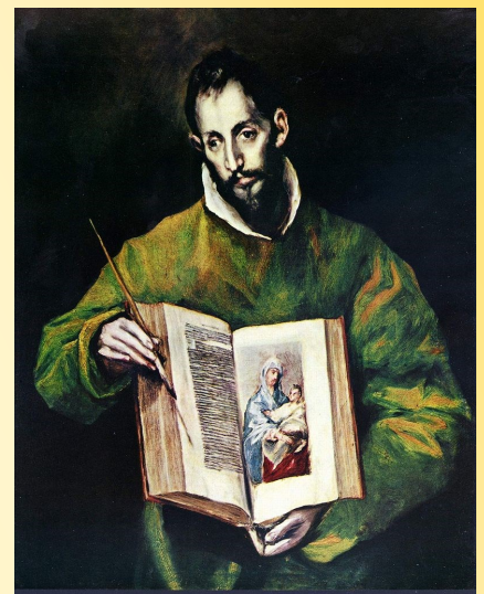
"St Luke" By El Greco, ca 1602-1605

35% of Luke's Gospel comes from Mark; 20% comes from Q and 40% comes from L (material unique to Luke). Luke uses more of his own source (L) than Matthew uses of his own source (M). This makes sense when you consider that Luke had completed, "investigating everything accurately anew (1:3);" he must have uncovered more previously unknown information than the other synoptic Gospels.