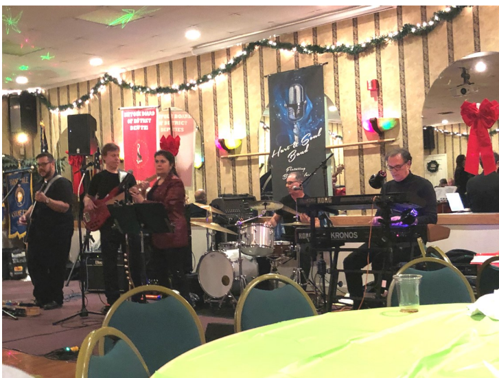
Nassau/Suffolk District Deputies Christmas Party

The Father McGivney Guild 1 Columbus Plaza New Haven, CT 06510-3326 □ USA www.fathermcgivney.org