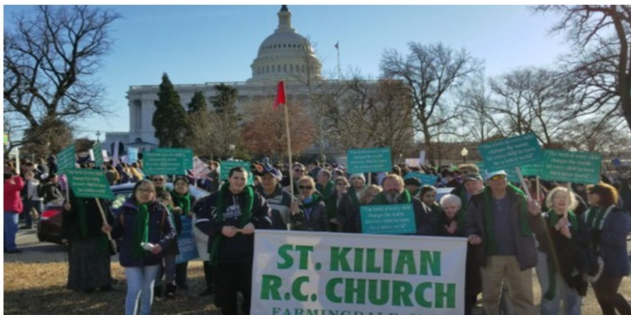
St. Kilian Parishioners and Members of KofC #2204 (St Kilian Council) at the March For Life. 2018

BE PART OF THE PRO-LIFE VOICE—SIGN UP TODAY!