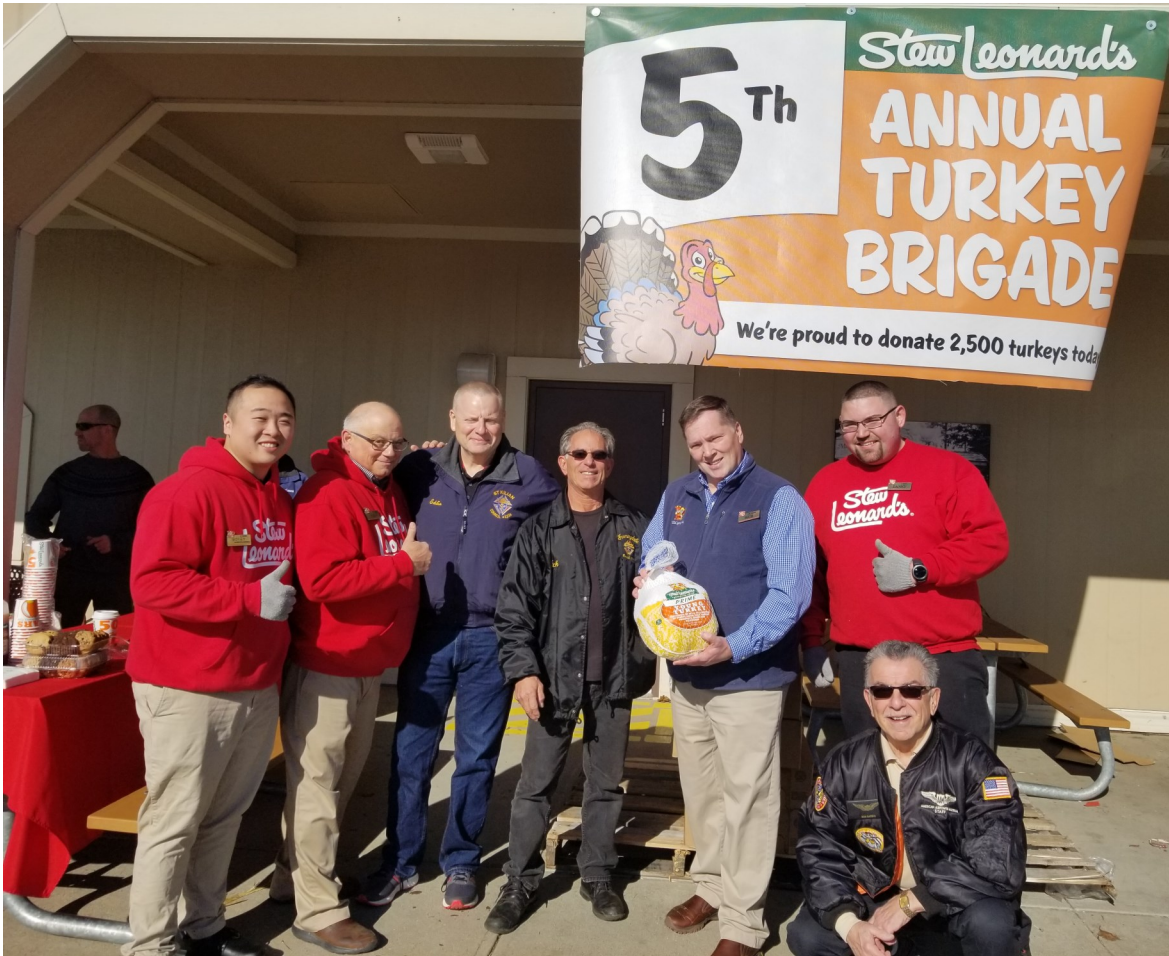
Knights in action Maybe can post them in the mariner 4 December giving away turkeys.