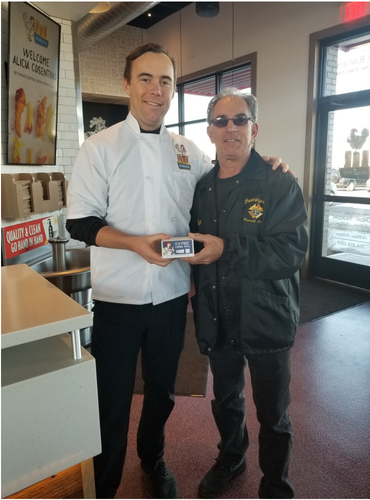
Knights receive a 150 gift cards to new chicken establishment PDQ Located on route 110 Farmingdale