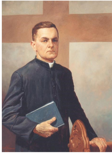
Father McGivney Pray for Us

Meetings are held on the 1st and 3rd Tuesdays of each month in the Council Hall located at the intersection of Morton Street and Garity Place. The mailing address is 1 Morton Street, Farmingdale, NY 11735-4340. The deadline for material for publication in the Mariner is the Friday that follows the 3rd Wednesday of the prior month. PLEASE keep this deadline in mind for articles you wish to have publish in the Mariner.