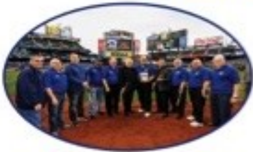
NYS Knights of Columbus receiving the Spirit Award 2019

Join us at Citifield on FRIDAY, MAY 28, 2021 AT 7:10 PM to watch the RIVALRY HEAT UP between the Braves & Mets