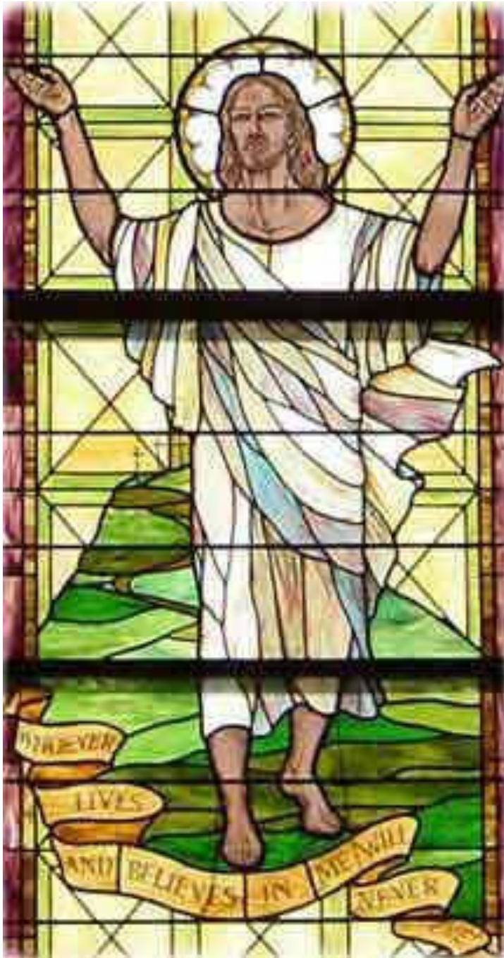
Stained Glass Window of “The Resurrection” at St Kilian Church

Brother Knights and Sister Columbiettes First off, I hope everyone is doing well considering what is going on in the world lately.