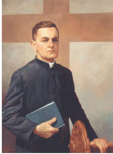
Father McGivney Pray for Us

Meetings are held on the 1st and 3rd Tuesdays of each month in the Council Hall located at the intersection of Morton Street and Garity Place. The mailing address is 1 Morton Street, Farmingdale, NY 11735-4340. The deadline for material for publication in the Mariner is the Friday that follows the 3rd Wednesday of the prior month. PLEASE keep this deadline in mind for articles you wish to have publish in the Mariner.