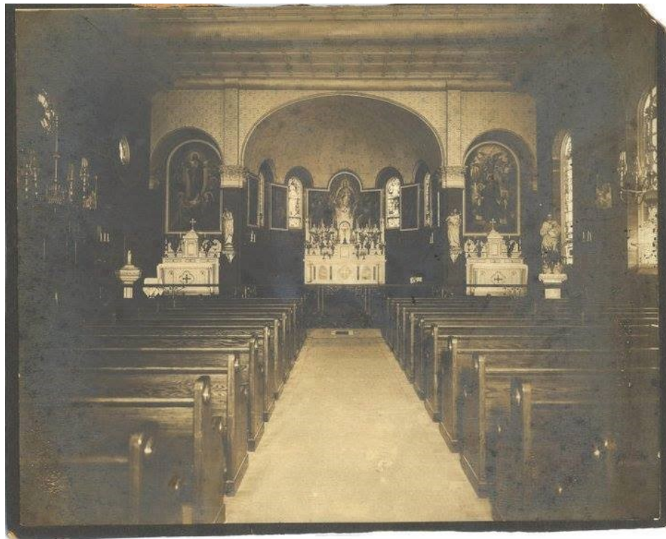
St. Kilian Church—1902