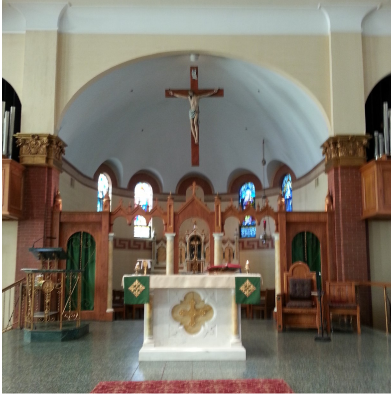
St. Kilian Church—Present Time