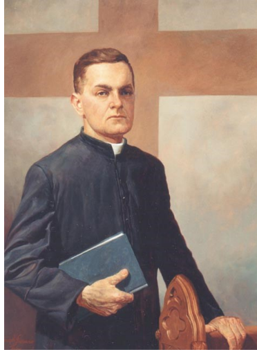
Father McGivney Pray for Us

Meetings are held on the 1st and 3rd Tuesdays of each month in the Council Hall located at the intersection of Morton Street and Garity Place. The mailing address is 1 Morton Street, Farmingdale, NY 11735-4340. The deadline for material for publication in the Mariner is the Friday that follows the 3rd Wednesday of the prior month. PLEASE keep this deadline in mind for articles you wish to have publish in the Mariner.