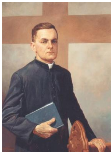
Father McGivney Pray for Us

Meetings are held on the 1st and 3rd Tuesdays of each month in the Council Hall located at the intersection of Morton Street and Garity Place. The mailing address is 1 Morton Street, Farmingdale, NY 11735-4340. The deadline for material for publication in the Mariner is the Friday that follows the 3rd Wednesday of the prior month. PLEASE keep this deadline in mind for articles you wish to have publish in the Mariner.