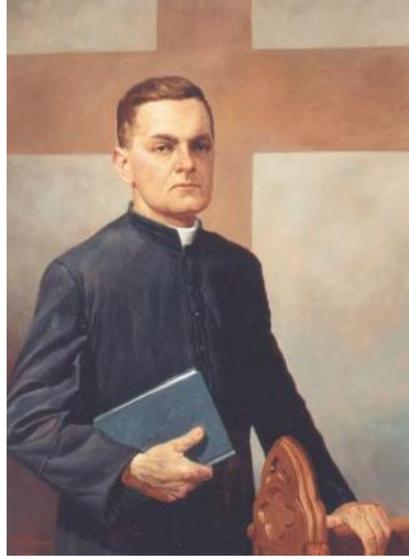
Father McGivney Pray for Us

Meetings are held on the 1st and 3rd Tuesdays of each month in the Council Hall located at the intersection of Morton Street and Garity Place. The mailing address is 1 Morton Street, Farmingdale, NY 11735-4340. The deadline for material for publication in the Mariner is the Friday that follows the 3rd Wednesday of the prior month. PLEASE keep this deadline in mind for articles you wish to have publish in the Mariner.