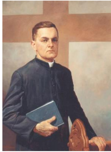
Father McGivney Pray for Us

Meetings are held on the 1st and 3rd Tuesdays of each month in the Council Hall located at the intersection of Morton Street and Garity Place. The mailing address is 1 Morton Street, Farmingdale, NY 11735-4340. The deadline for material for publication in the Mariner is the Friday that follows the 3rd Wednesday of the prior month. PLEASE keep this deadline in mind for articles you wish to have publish in the Mariner.