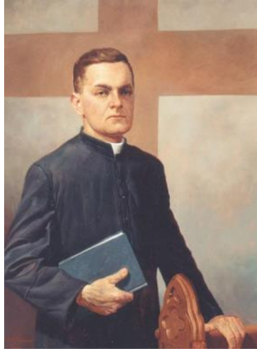
Father McGivney Pray for Us

Meetings are held on the 1st and 3rd Tuesdays of each month in the Council Hall located at the intersection of Morton Street and Garity Place. The mailing address is 1 Morton Street, Farmingdale, NY 11735-4340. The deadline for material for publication in the Mariner is the Friday that follows the 3rd Wednesday of the prior month. PLEASE keep this deadline in mind for articles you wish to have publish in the Mariner.